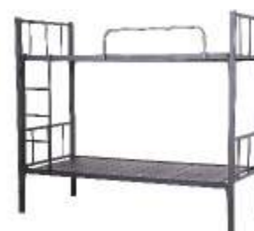
Model: BB14 (extra heavy short stripe) Size: 1900*900*1700cm