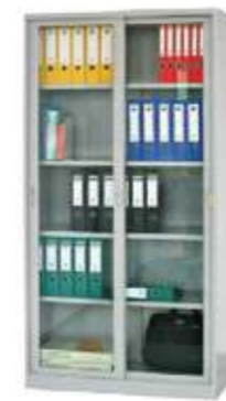
Model: SC06 Size: 1830-850-400 mm