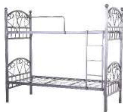
Model: BB07 (mesh type new) Size: 1900*900*1700cm