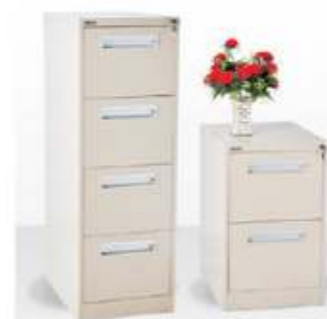
Model: DC03 Size: W460-D600-720mm : W460 -D600-1020mm : W460-D600-1320mm