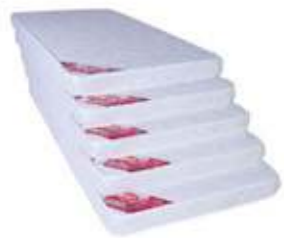
Model: M04 (medical type)