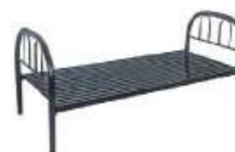
Model: SB02 NB (wide stripe) Size: 1900*900*720/750/500