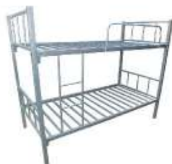
Model: BB10 (square/grey) Size: 1900*900*1700cm