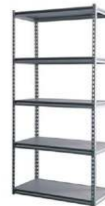
Model: GS 1 Size: H-1830*W-900*D-450mm Size: H-2450*W-900*D-400/600