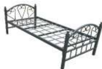
Model: SB08 (flat new design) Size: 1900*900*720/750/500 Weight: 17/21kgs