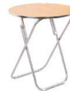
Model: FT 03 60/70/80/90 Size: 20mm/25mm Height: 71cm