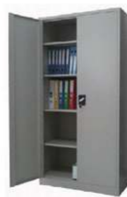
Model: SC02 Size: 1830-850-400 mm