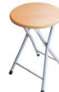
Model: FT 02 legs: 20mm Height: 50cm