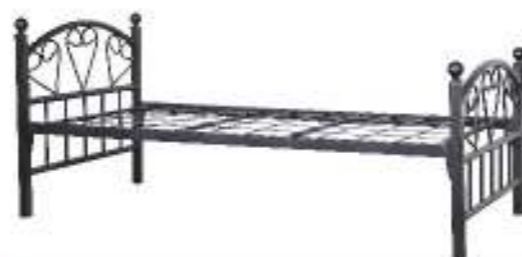
Model: SB09 (flat type with support) Size: 1900*900*720/750/500 Weight: 14kgs