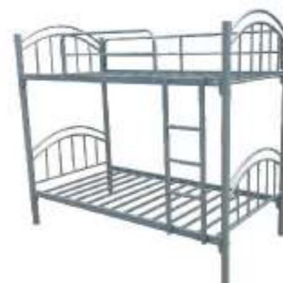
Model: BB12 (square new) Size: 1900*900*1700cm