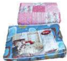
Model: M07 (comforters)