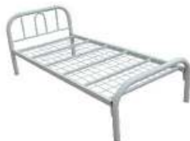
Model: SB05 (mesh gray) Size: 1900*900*720/750/500 Weight: 16kgs