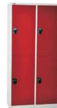
Model: L06 size: 1830-1200-450mm