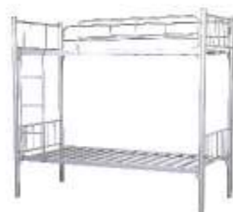
Model: BB11 (silver) Size: 1900*900*1700cm