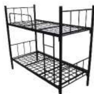
Model: BB09 (flat design 1) Size: 1900*900*1700cm