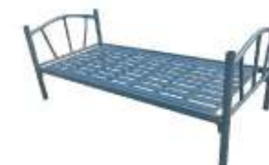
Model: SB03A (wide stripe new design) Size: 1900*900*720/750/500 Weight: 16/20kgs NB