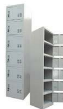
Model: L05 (six door) Size: 1830*380*450mm Thickness: 0.4mm/0.5mm/0.6mm/0.8mm (optional)