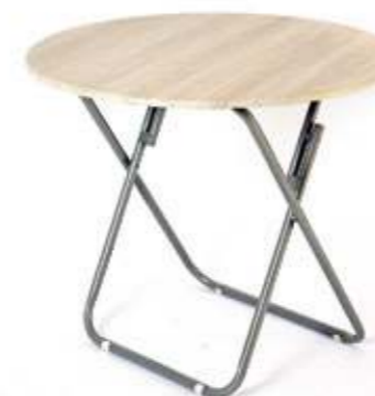
Model: FT 05