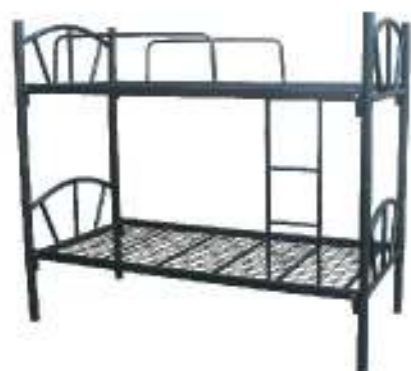
Model: BB06 (mesh type) Size: 1900*900*1700cm