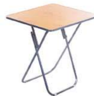
Model: FT 01 Size: 50*50/50*70/60*90/70*120 Legs: 20mm/25mm Height: 71cm