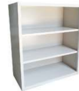
Model: SC 08