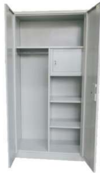
Model: SW02 Size: 1830-900-400 mm