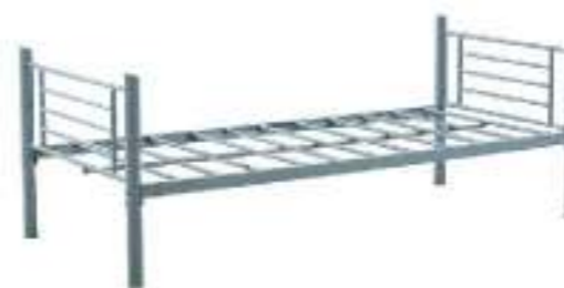
Model: SB10 Size: 1900*900*720/750/500 Weight: 18/24kgs