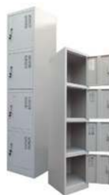
Model: L04 (four door) Size: 1830*380*450mm → 0.4mm/0.5mm/0.6mm/0.8mm (optional)