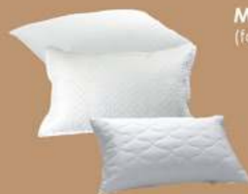
Model: P01 (foam and press pillow)

Sahil Al Zuhoor GTC have the years of relentless experience to export the finest industrial linen across Dubai & the world had gotten us the tag of industry leader. Our high quality products gracefully enhance functionality and decor.