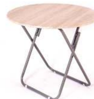
Model: FT 04