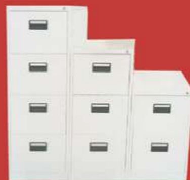
Model: DC02 Size: W460-D600-720mm : W460 -D600-1020mm : W460-D600-1320mm