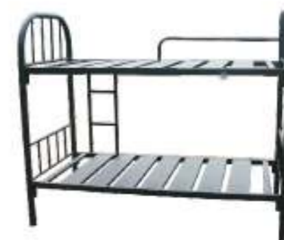
Model: BB15 (extra heavy short stripe new) Size: 1900*900*1700cm