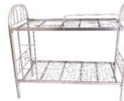
Model: BB04 (meshype) Size: 1900*900*1700cm