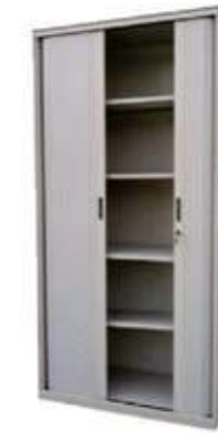
Model: SC04 Size: 1830-850-400 mm