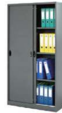
Model: SC03 Size: 1830-850-400 mm

Steel wardrobes that take limited vertical storage space. Apt for fewer space occupancies.