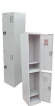
Model: L02 (double door) Size: 1830*380*450mm Thickness: 0.4mm/0.5mm/0.6mm/0.8 mm(optional)