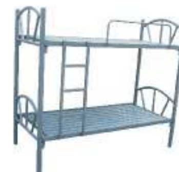
Model: BB16 Size: 1900*900*1700cm