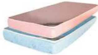
Model: M02 (foam mattress quilting)