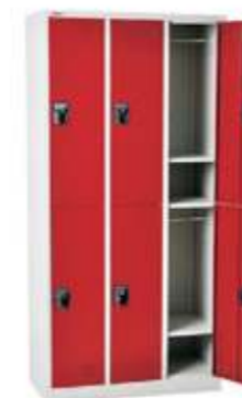
Model: L07 Size: 1830-800-450mm