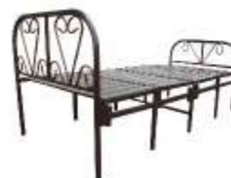
Model: SB12 (Folding type) Size: 1900*900*720/750/500 Weight: 19 kgs