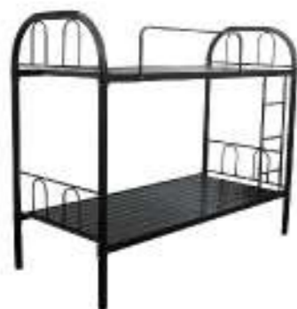
Model: BB02A (Fullstripe) Size: 1900*900*1700cm