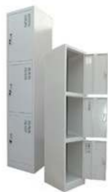
Model: L03 (three door) Size: 1830*380*450mm Thickness: 0.4mm/0.5mm/0.6mm/0.8 mm(optional)