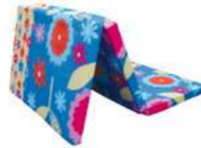
Model: M03 (folding type)