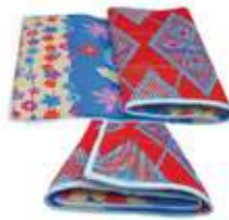
Model: M05 (mat type)