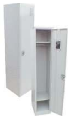
Model: L01 (single door) size: 1830*380*450mm Thickness: 0.4mm/0.5mm/0.6mm/0.8mm (optional)