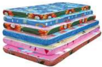
Model: M01 (foam mattress)