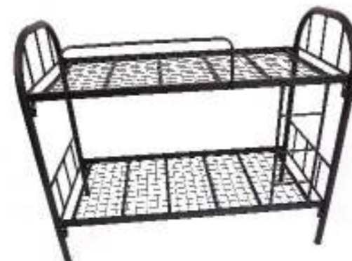
Model: BB03 (meshtype) Size: 1900*900*1700cm