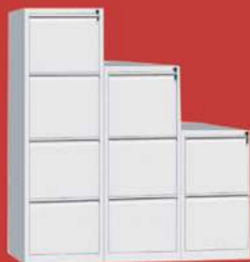
Model: DC01 Size: W460-D600-720mm : W460 -D600-1020mm : W460-D600-1320mm