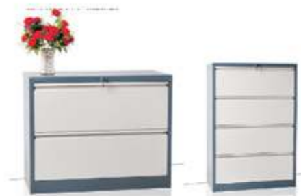
Model: DC04 Size: W460-D600-720mm : W460 -D600-1020mm : W460-D600-1320mm