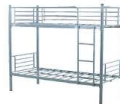
Model: BB13 (full support) Size: 1900*900*1700cm