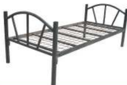
Model: SB06 (mesh new design) Size: 1900*900*720/750/500 Weight: 16kgs/20kgs