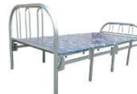
Model: SB15 (folding type 03) Size: 1900*900*720/750/500 Weight: 22kgs