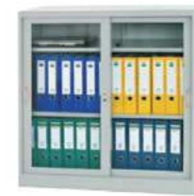
Model: SC07 Size: 900-850-400 mm