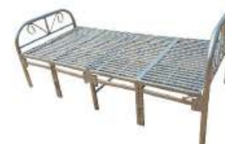
Model: SB13 (folding type 01) Size: 1900*900*720/750/500 Weight: 19 kgs