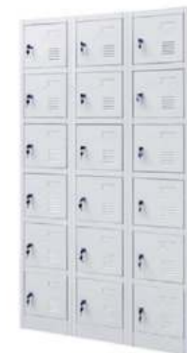
Model: L08 Size: 1900-1200-450mm