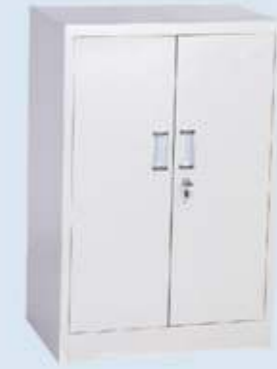
Model: SR04 (with door and lock)