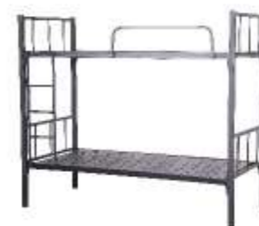
Model: BB15A (extra heavy long stripe) Size: 1900*900*1700cm