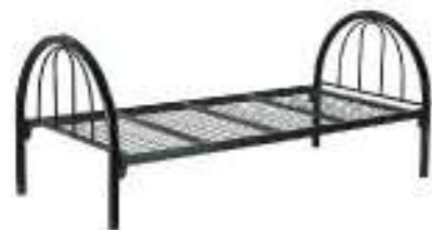
Model: SB04 (mesh type) Size: 1900*900*720/750/500 Weight: 14kgs