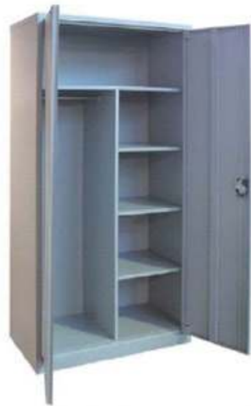
Model: SW01 Size: 1830-900-400 mm