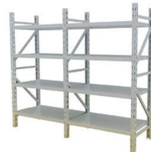
Model: GS 2 Size: H-2450*W-D400/600mm