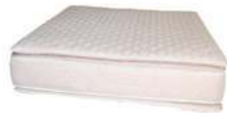
Model: M06 (pillow top medical)