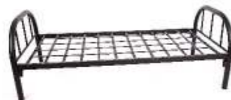
Model: SB07 (flat type) Size: 1900*900*720/750/500 Weight: 18/24kgs