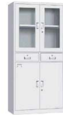
Model: SC05 Size: 1830-850-400 mm