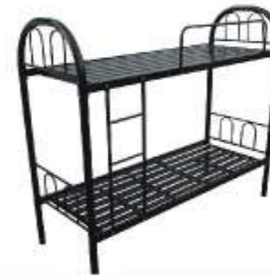
Model: BB01 (normal stripe) Size: 1900*900*1700cm