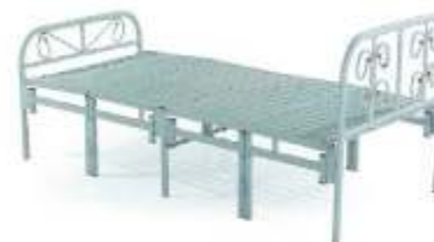
Model: SB14 (folding type) Size: 1900*900*720/750/500 Weight: 19 kgs