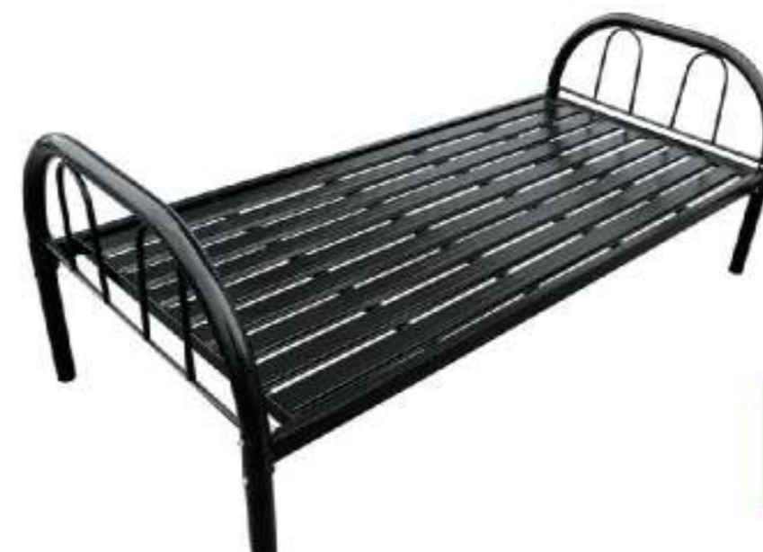
Model: SB01 (normal stripe) Size: 1900*900*720/750/500 Weight: 14kgs

Stretch out in a bed that fits your needs from our range of single beds. Choose from our robust frames to stealthy built beds.