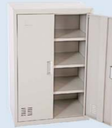
Model: SR03 (with door)