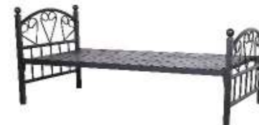
Model: SB11 (extra heavy long stripe) Size: 1900*900*720/750/500 Weight: 14kgs