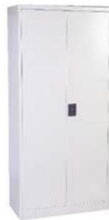
Model: SC 01

Steel Cabinets offered to come in sturdy construction finish and comes developed in the cold-rolled steel sheet material finish of different thicknesses.