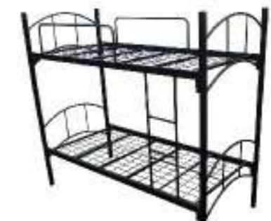
Model: BB05 (meshype) Size: 1900*900*1700cm

Our imported double-storey steel beds are space conscious and most preferred furnishing in the labour dorms and hostels.