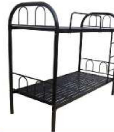
Model: BB02 (wide stripe) Size: 1900*900*1700cm