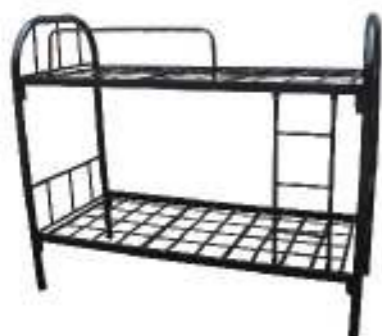
Model: BB08 (flat type) Size: 1900*900*1700cm