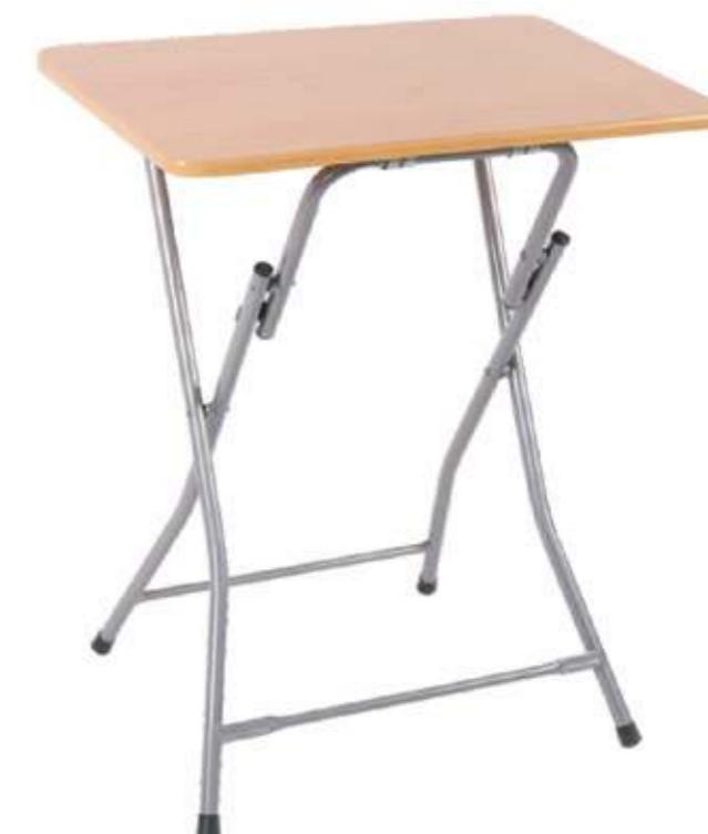
Model: FT 06