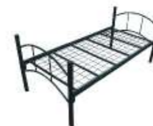
Model: SB03 (mesh) Size: 1900*900*720/750/500 Weight: 16kgs/20kgs